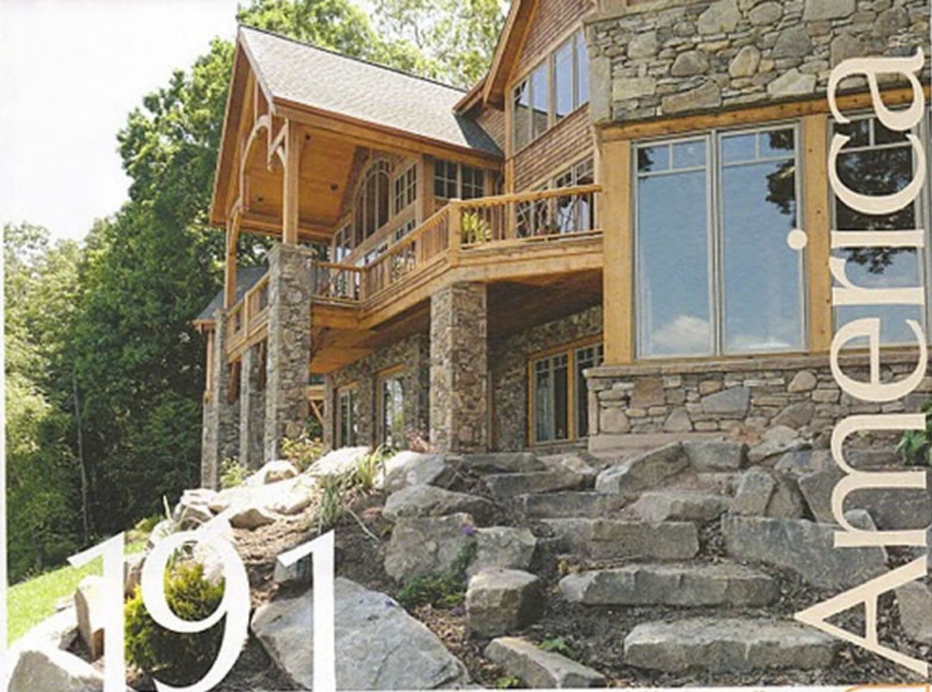
For plan information, see page 36.